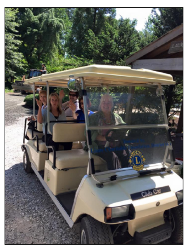
Touring in the Motorized Cart

The Lions Club of Wayne donated a second motorized cart to FOLA. These enable us to provide an opportunity for the elderly and physically challenged to experience the arboretum.