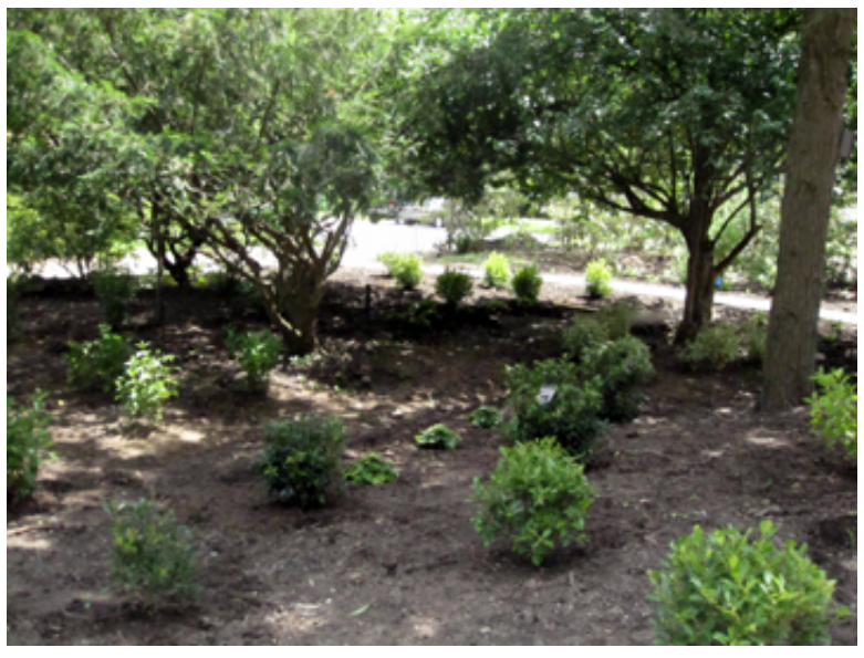
Native Plant Demonstration Garden