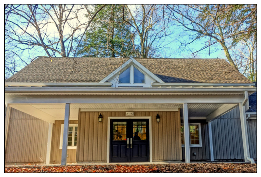
Knippenberg Center for Education

This has been a transformational year for Friends of Laurelwood Arboretum. We dedicated the Knippenberg Center for Education and the Native Plant Demonstration Garden and completed our Educational Greenhouse. We now have an indoor space for programs and meetings, as well as handicapped-accessible restrooms. We have a dedicated greenhouse for horticultural displays and hands-on educational activities. And we have a Native Plant Demonstration Garden that serves as landscaping for the Knippenberg Center but also has the educational purpose of teaching adults and children about the importance of native plants and their use in their home gardens.