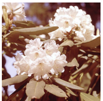
R. 'Hardy Giant'