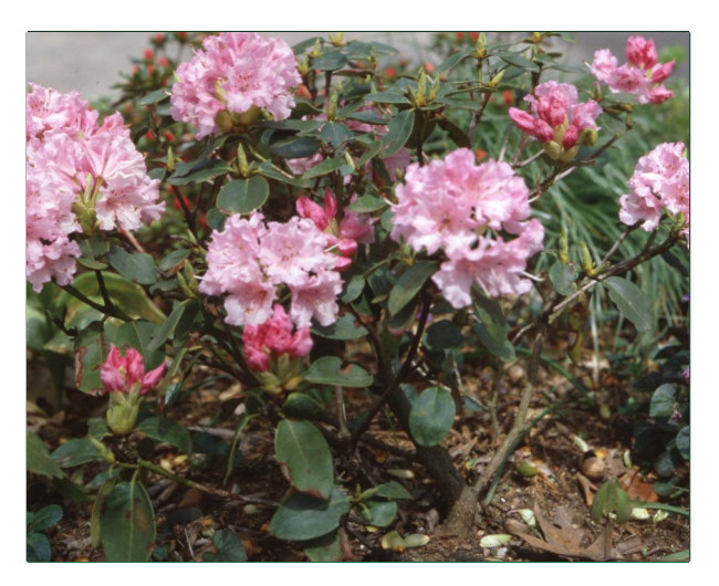
R. 'Laurel Pink'