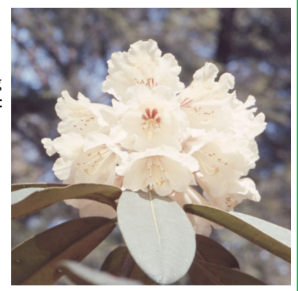
R. 'Big Mac'