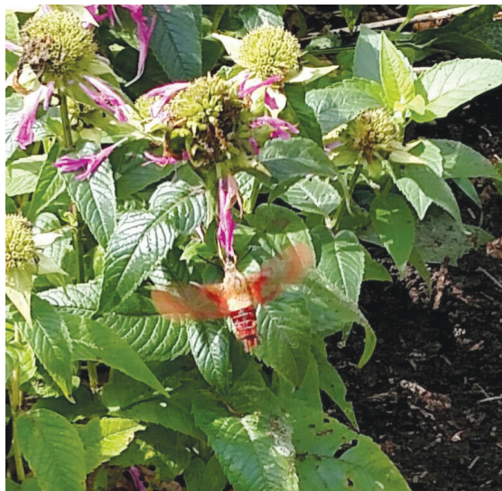
Hummingbird Moth on Bee Balm

Our Pollinator Garden is proud to be a "Monarch Waystation," certified by the University of Kansas, for providing food and shelter for monarch butterflies as they migrate through North America.