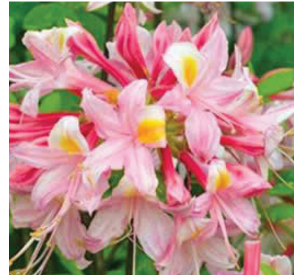
Rhododendron 'Choptank Rose' azalea Native to New Jersey

Friends of Laurelwood Arboretum Connecting People with Nature